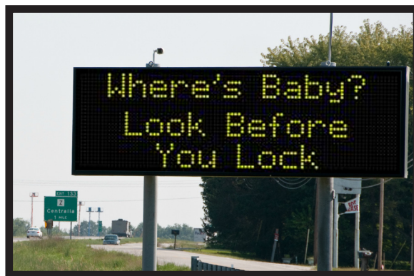
One of many highway signs posted during July courtesy of the Missouri Department of Transportation (MoDOT) and KC SCOUT.

MoDOT and KC SCOUT proved to be major partners in the effort to prevent heatstroke deaths this summer. They posted the message “ Where’s Baby? Look Before You Lock ” on their electronic highway signs all across the state of Missouri during July and part of August. Now, they have agreed to print the message on the Missouri State driver education booklets. Look for it next time you’re at the DMV!