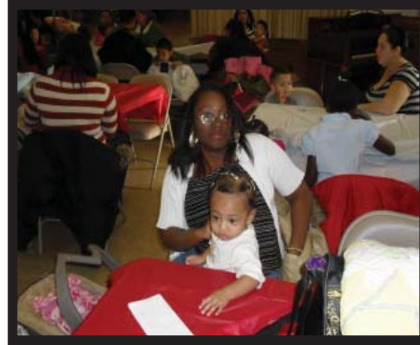
KCHS program participants celebrating together, and enjoying the spirit of sharing and giving at the annual holiday celebration.

As we come to the close of another year, Kansas City Healthy Start (KCHS) and the Dedicated Dads program are grateful to have been allowed to touch so many lives of families in the community. We have also been deeply moved and motivated by these families who strive to make their lives, and their children's lives, healthier and safer with not much more than determination, resilience and love to keep them going. Today, the barriers and obstacles families face to provide their basic needs are proving to be a real challenge. We want